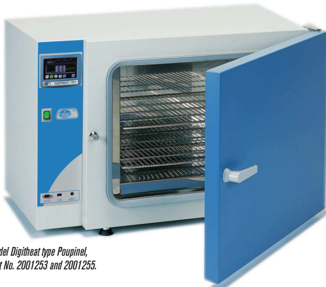
Model Digitheat type Poupinel, Part No. 2001253 and 2001255.