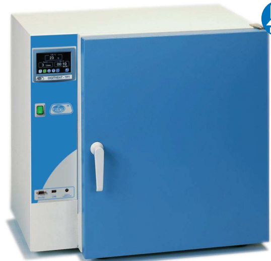
Model Digitheat, Part No. 2001251, 2001252 and 2001254.