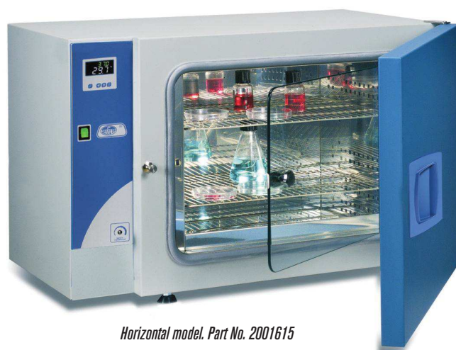
Horizontal model. Part No. 2001615