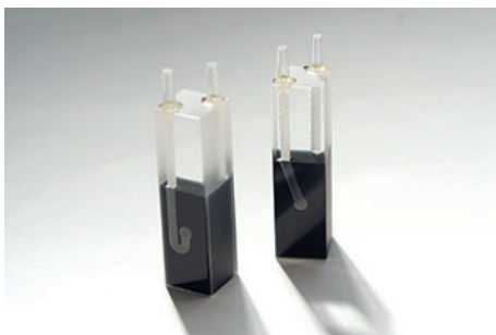
DIMENSIONS - flow-through cells