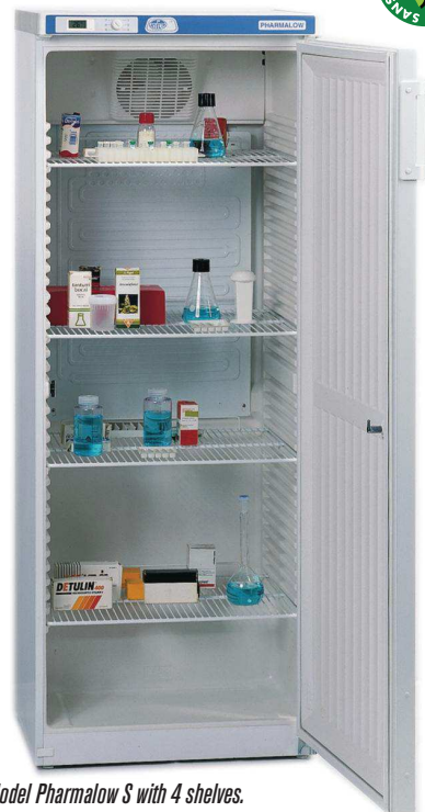
Model Pharmalov S with 4 shelves.

Comes complete with steel shelves, PVC laminated.