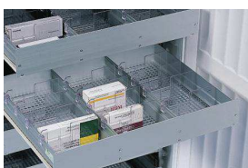
Details of frame support, drawers, dividers and partitions.