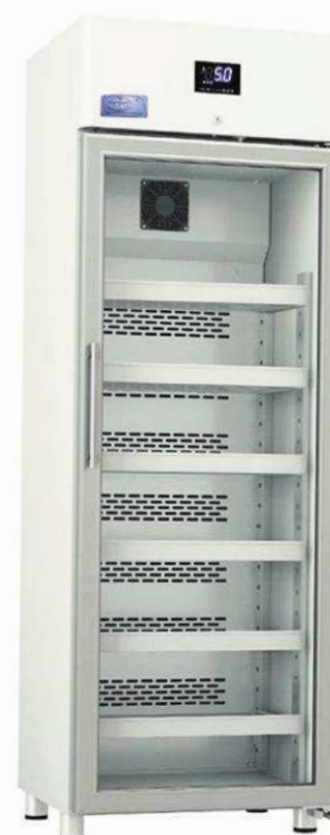
Model Pharmalov M with 6 shelves.