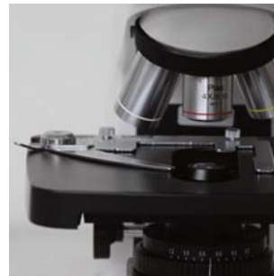
[3] Clamp that can hold up to two standard size slides at the same time