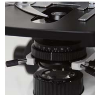
[4] Köhler illumination system