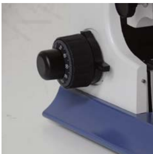
[1] Coaxial knobs for coarse and fine focusing adjustment