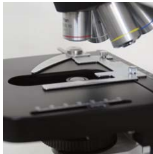
[2] Mechanical stage